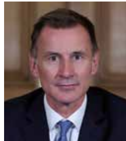
Official portrait of Jeremy Hunt MP

Some of the rumours, such as IHT reform, did not come to fruition, but there is still a chance – the Spring Budget is now less than four months away.